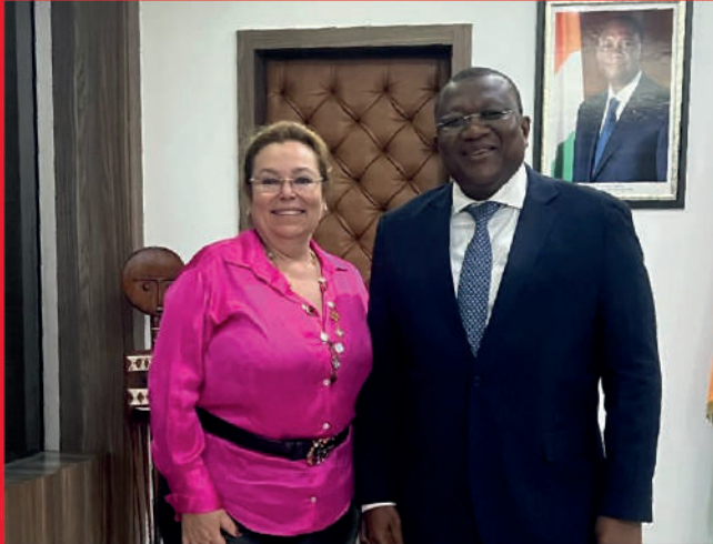
Sponsorship agreement from Mr. Amadou COULIBALY, Minister of Communication and Government Spokesperson.