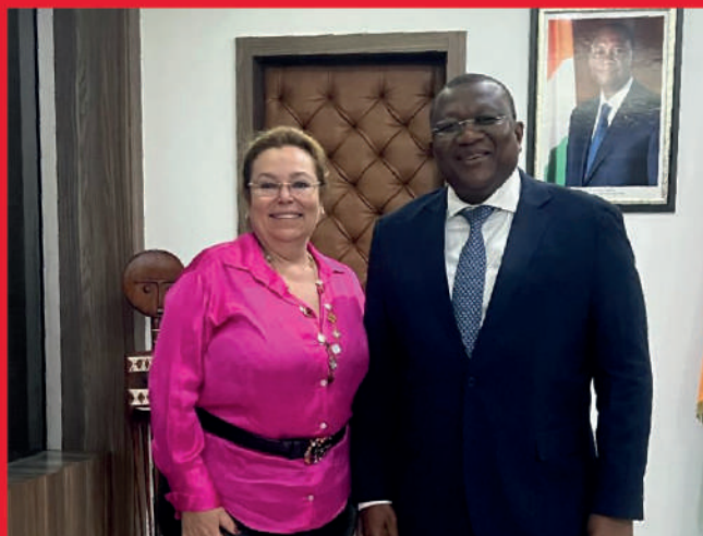
Sponsorship agreement from Mr. Amadou COULIBALY, Minister of Communication, Government Spokesperson. - July 2024 Edition